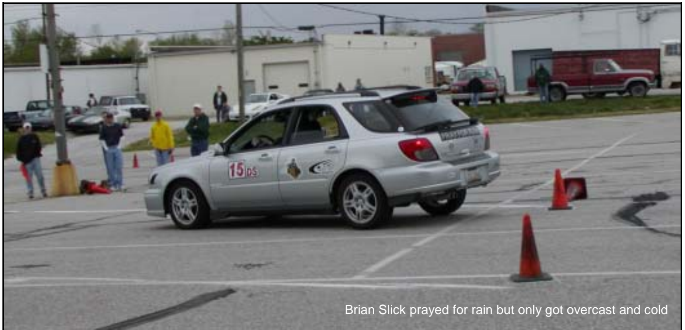
Brian Slick prayed for rain but only got overcast and cold