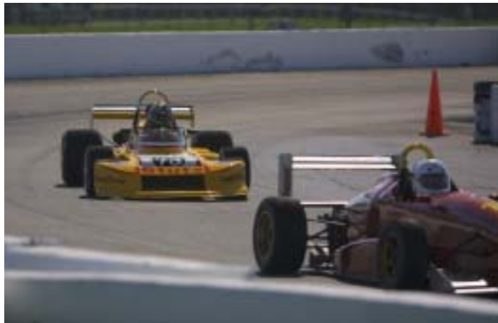
May 2003 Clutch Chatter 15