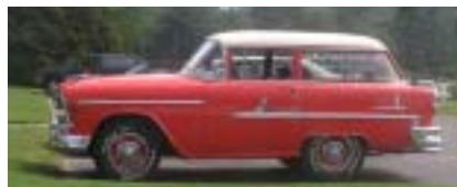
Who said Retro Styling for the concept cars?

AND we can all get out to the Indy Double Regional at IRP on May 8-9