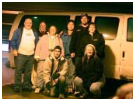
some of our Indy Region group went to the Detroit Auto Show