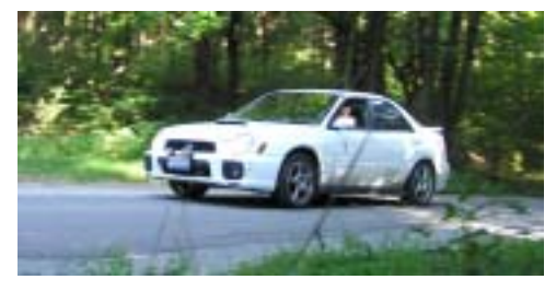
Class E Winner Car 3