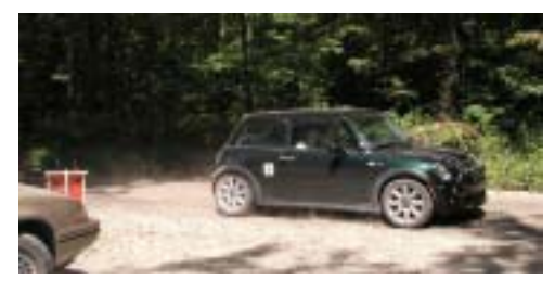
Class L Winner Car 8