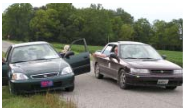
Perimeter Restriction Winners