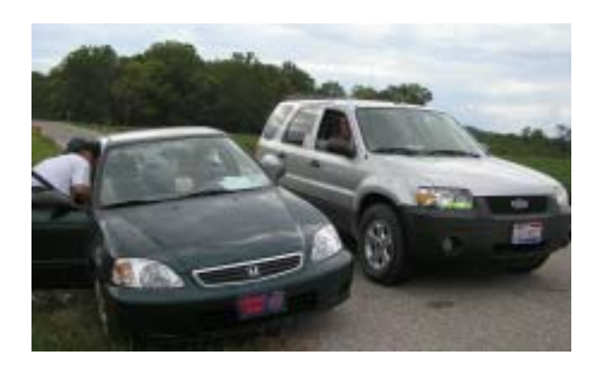
Perimeter Restriction Class S Winner Car 1