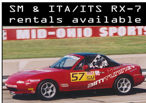
2002 CenDiv SM Champions