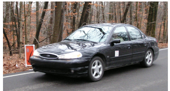
Map Rally March 19 "In Search Of ....."