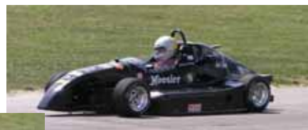
Knuteson Weida F500