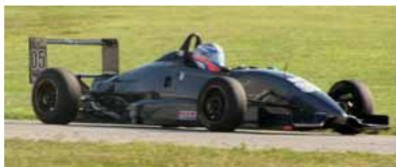
FC Larue Caldwell