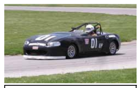
FOR SALE: 1999 E prod Miata Mazda close ratio transmission, Boig engine, Braake body work, Electromotive Tech III engine control.

Chuck Hanson (317) 780-9007 dtcgh@verizon.net