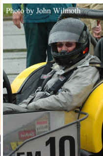
Spirit of Solo Jack Banker