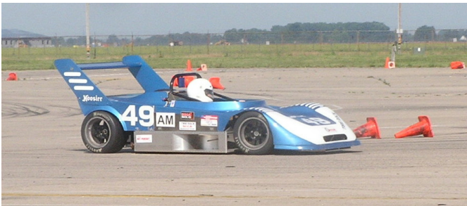
See ads on page 9