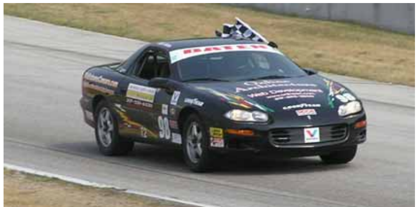
Bill Baten T2