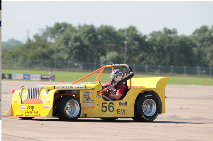
Who said Jeeps aren't fast?