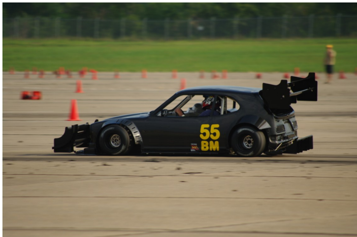
Very cool looking B Mod car. All carbon fiber body.