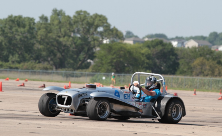
Lee Miller - E Modified