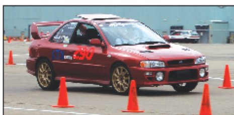
Driving through a set of cones, the No. 290 driver prepares for a hard left turn Sunday during the SCCA Border Wars challenge. SCCA members from Indianapolis, Dayton and Cincinnati represented their respective regions in hopes to win the traveling trophy.