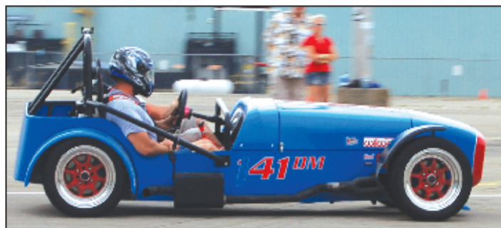
The No. 41 class DM car heads into a turn Sunday during the Sports Car Club of America's Border Wars Challenge. Many of the cars entered in the challenge had multiple drivers, like this one.