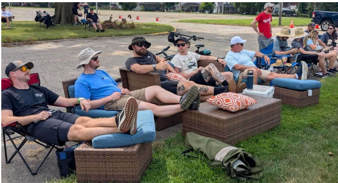
Spectators at the July 14 Indiana State Fairground Event